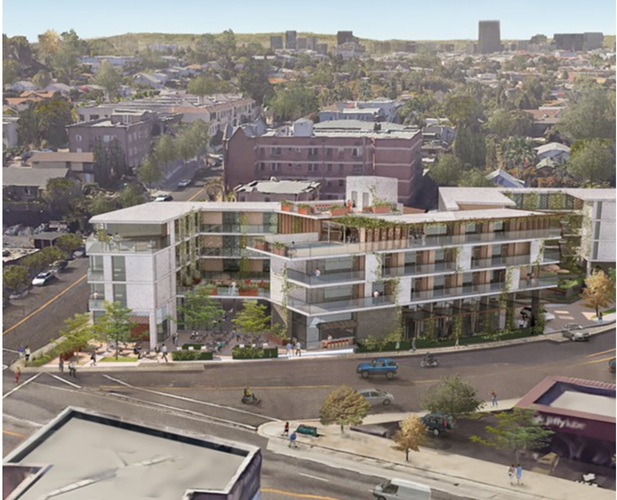
Artist rendering of the hotel

Now, the developers say they have a compromise that should satisfy the naysayers — instead of a five-story mixed-use building at 4000 Sunset, they're proposing a four-story, 94-room hotel.